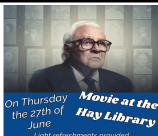
On Thursday the 27th of June Movie at the Hay Library Light refreshments provided

Rhyme Time: Children's reading and activities are held every Tuesday commencing at 10.30am for 0-5 years old. Knitting & Scrabble Groups: Are held each Wednesday at 10am. Come and enjoy some knitting and scrabble with good company and a cuppa.